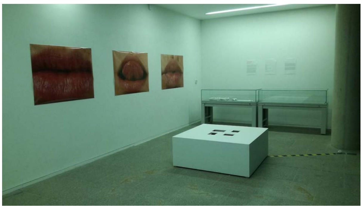
Figure 3. Installation image of Comfort Zones exhibition at Liverpool School of Art & Design, 2017. Pictured: Eva Petersen, Yes, I am Looking Straight at You , 2017, photographic prints. Bee Hughes, Infinite Cycles , 2017, multimedia installation.

In the poem I aim to mirror the feeling of frustration that arose while reading online advice which presents little space for variation, outliers or non-conforming bodies and cycles. For example, in a period is... (2016), the repetition of a woman and bleeds reflects irritation that the original text described bleeding categorically as something women do. The exasperation was twofold: first, there was the implication that womanhood should be defined by the ability to menstruate; second was the idea that only cis women menstruated. In the reiteration and fragmentation of these phrases, I am opening this orthodoxy up to question rather than reinforcing it as hard fact — by repeating the words until they lose their meaning and their power to define menstrual experience.