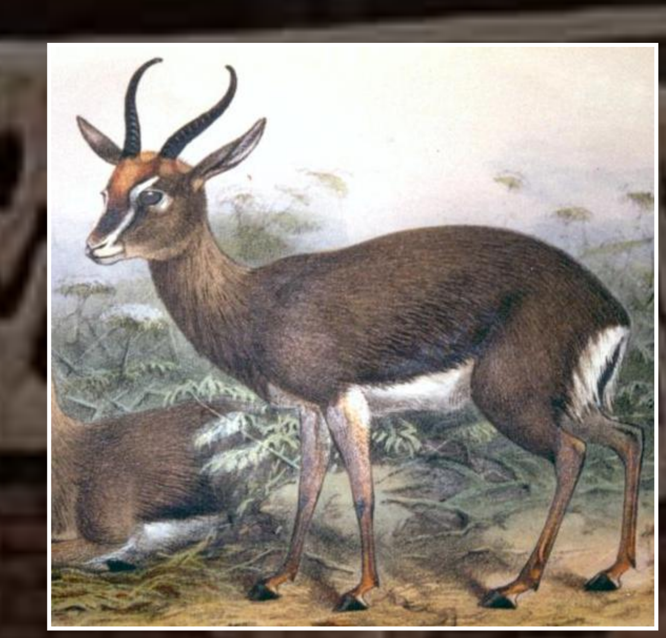
Fig. 3 Drawing of G. muscatensis Brooke, 1874 kept at London Zoo