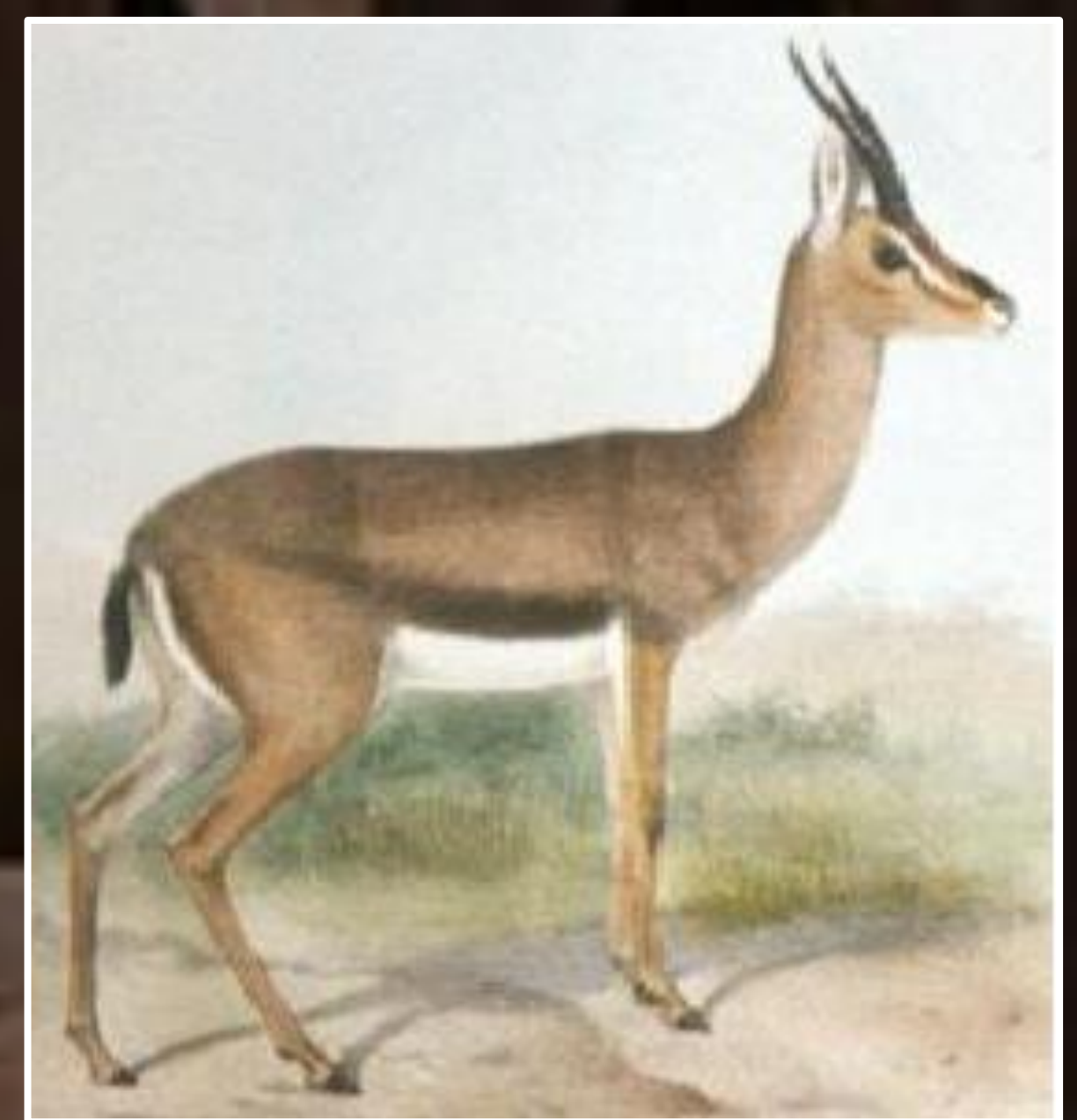
Fig. 1 Drawing of G. arabica erlangeri Neumann, 1906 in Sclater and Thomas' (1898) 'Books of Antelopes'

(Fig. 3). Both taxa are considered 'extinct in the wild' by the IUCN Red List. Past conservation efforts have been plagued by confusion about the phylogenetic relationship among various—phenotypically discernable—populations (e.g., G. erlangeri, G. muscatensis), and even the question of species boundaries was far from being certain. This lack of knowledge had a direct impact on conservation measures, especially ex situ breeding programmes, hampering the assignment of captive stocks to potential conservation units.