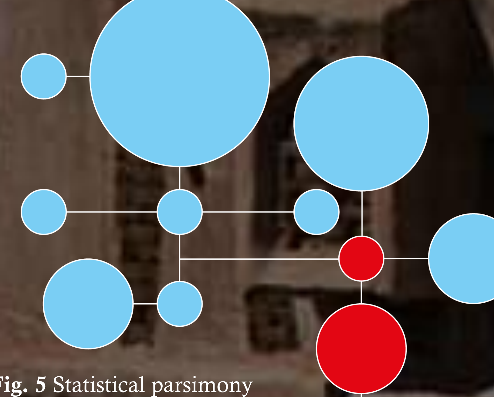
Fig. 5 Statistical parsimony network with G. erlangeri haplotypes (red) and G. arabica haplotypes (blue) with circles sizes being proportional to number of individuals with corresponding haplotype and connecting line length being proportional to mutation steps

Therefore, we argue that animals held in captivity are the product of selective breeding leading to smaller, darker and tamer forms of mountain gazelles with no equivalent found in the wild. These findings correspond with the historic mention of pet gazelles from Yemen and southern Saudi Arabia.