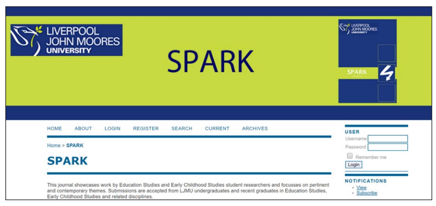
Figure 1. SPARK journal home page (http://openjournals.ljmu.ac.uk/spark)

producing a full-issue PDF as they had done previously, so just required support to upload this onto OJS. This provided a place to host the journal and a stable URL to distribute.