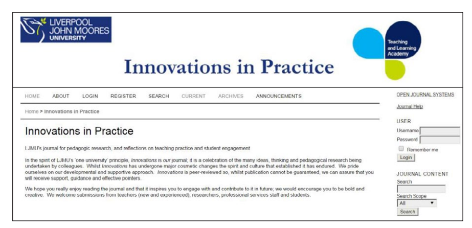
Figure 2. Innovations in Practice journal home page (http://openjournals.ljmu.ac.uk/iip)