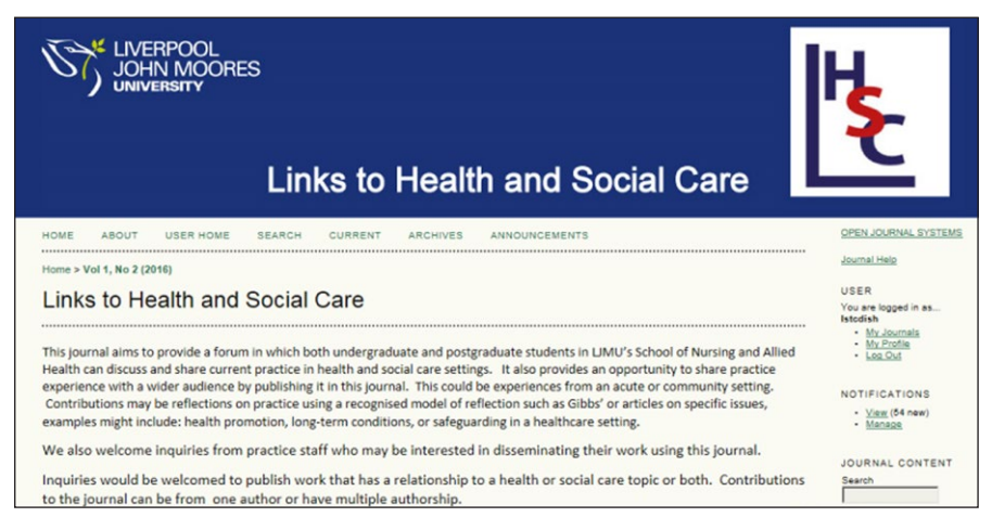
Figure 3. Links to Health and Social Care journal home page (http://openjournals.ljmu.ac.uk/lhsc)