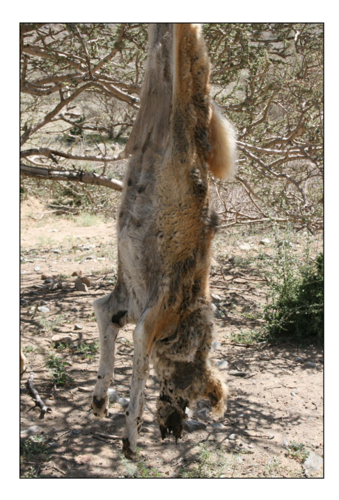
Figure 2. Arabian wolf killed and displayed in a "hanging tree" in western Saudi Arabia.

The Arabian wolf, against the odds, tenaciously survives throughout much of its original distribution range in Saudi Arabia. A lack of herding of domestic livestock and abundant and ubiquitous refuse in Saudi Arabia may also have contributed to the wolf's successful persistence as they may achieve densities in relation to the available food source (White et al. 2008). They suffer greatly from persecution with "hanging trees" – sites (often trees) traditionally used to display wolves (as well as other predators such as striped hyaena Hyaena hyaena , caracal Felis caracal and leopard Pan thera pardus ) – testament to their encounters