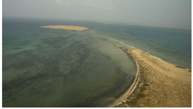
figure 1: Aerial image showing the sampling location at Abu Tok on As Saqid Island, Farasan Archipelago. A shallow bank, consisting of algae beds and reefs, connects As Saqid to Safrah Island. In the background Khur Abu Tok, Saghir ar-Ryaq and Kabir ar-Riyaq Islands which connect to Safrah Island by a coral reef.

The Farasan Islands are located in the Red Sea about 40 km off the Arabian coast, opposite the town of Jizan in the extreme southwest of Saudi Arabia. This archipelago is situated on the remarkably shallow Farasan Bank and comprises more than 300 islands, islets and shoals of which only three (Farasan Kebir (400 km<sup>2</sup>), Qummah (15 km<sup>2</sup>) and As Saqid (160 km<sup>2</sup>) (figure 1)) are permanently inhabited. Geologically, the Farasan Islands consist of an originally more or less uniform flat fossil coral reef that rose 0–30 m above sea level during the late Pliocene to early Pleistocene (McFayden, 1930).