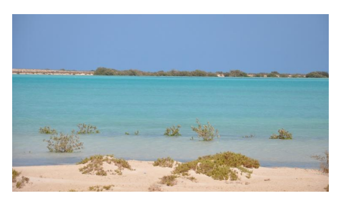
figure 5: A shallow, sandy lagoon showing the sampling location at As Saqid West. Mangrove trees growing at the beach while farther outside algae beds and reefs fringe the lagoon.

Bivalve species were determined using the following references: Sharabati (1984); Delsaerdt (1986); Oliver (1992); Dekker and Goud (1994); Bosch et al. (1995); Oliver and Chesney (1997); Vidal (1997); Oliver and Zuschin (2000); and Rusmore-Villaume (2008). The systematics and nomenclature used here predominantly follow Rosenberg et al. (2004).