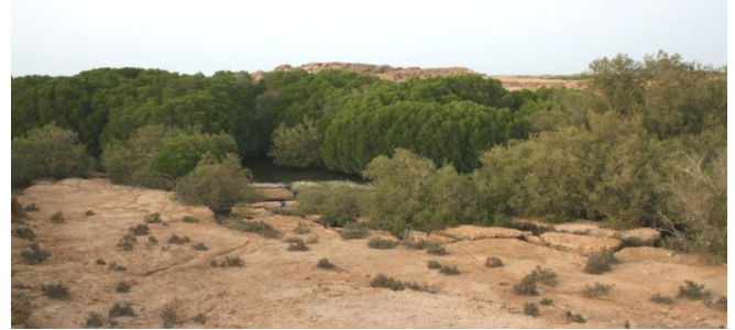
figure 2: A mangrove stand at Kharij as Sailah, growing in the deep crevices cutting into the coral rock of which the entire Farasan Archipelago consists.

This region of the Red Sea is poorly documented and the marine malacofauna has not been studied. This article presents a preliminary species list of bivalve molluscs inhabiting the coastal waters of the Farasan Islands. Previous records of marine molluscs from Saudi Arabia's Red Sea coast were published by Sharabati (1981). Dekker and de Ceuninck van Capelle (1994) carried out a survey of Yemen Red Sea shells collected during the Tibia-1 expedition in 1993. The most northern sampling locality (Zahrat Ashiq island) of their study area was about 50 km southeast of the area sampled in this study. Dekker and Orlin (2000) provide a checklist of all known marine molluscs of the Red Sea and adjacent areas. The findings of this study are compared to those of Dekker and de Ceuninck van Capelle (1994), Dekker and Orlin (2000) and the OBIS Indo-Pacific Molluscan Database (Rosenberg et al., 2004).