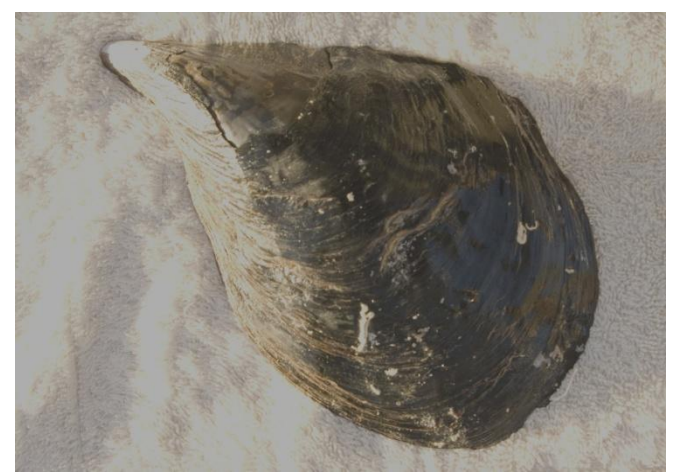
figure 3: Atrina vexillum (length c.22cm) Qummah Island (Farasan Archipelago).

Bivalve sampling was carried out from 27 March to 18 October 2009, at 18 localities on Farasan Kebir, As Saqid and Qummah islands. The shore in the study area is comprised predominantly of coral fringe reefs, lagoons and long sandy beaches. Occasionally there are small bays with Avicennia spp. or Rhizophora spp. mangroves (Kharij as Sailah, Khor Kandrah, Khor Farasan) (figure 2) or macroalgal beds and reefs off the shore line (Qummah, As Saqid West (figure 5)). The location of the sampling sites, their habitat type and species richness are shown in figure 4.