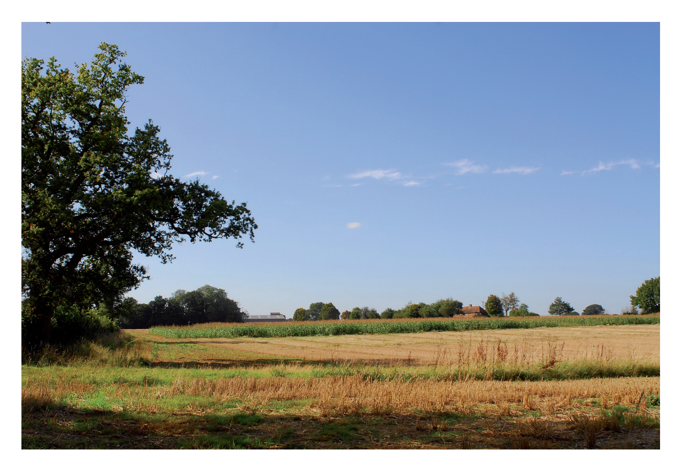
Fig. 2. The Broadbalk experiment at Rothamstaed. Wheat has been grown continually here since 1843 with different fertilizer regimes used in different parts of the field. From 1910 onwards a greater attention was given to the microbiology of the soil following the demonstration that protozoa were important in the soil ecology and hence the plant production on the field (Stevenson 1989). For example, it was shown that amoebae were more common on plots receiving farmyard manure (Russell 1967).

Clearly there is still an need to explain the importance of soil protists to the wider scientific community – for example in a recent otherwise excellent book on the biology of soils (Bardgett 2005) the index only has four entries under 'protozoa.' However, from an applied microbiology perspective slowly things are starting to change (Gardi et al. 2009). This was demonstrated by a recent conference held in London in June 2012 by the Institute of Ecology and Environmental Management which argued for a more holistic approach to soil management – bringing together experts from a wide range of relevant disciplines. Indeed the publicity for this conference acknowledged that soil microorganisms are often neglected by the ecological community at large, yet their importance in all soil ecosystems makes them worthy of further study.