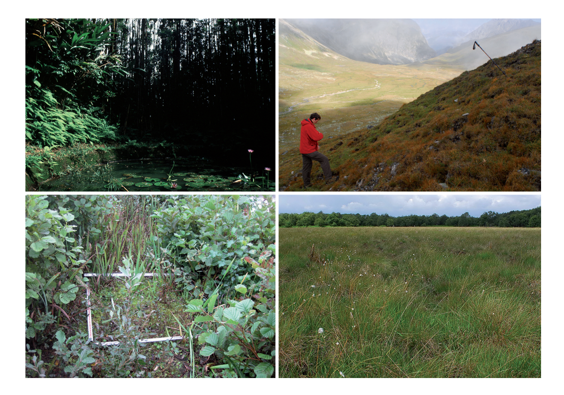
Fig. 3. Examples of protist diversity in a range of soil habitats. Top Left: The summit of Green Mountain (845 m a. s. l.), Ascension Island in the tropical South Atlantic. A single soil sample from under the bamboo produced three species of flagellates, two non-testate amoebae (gymnamoeba), one ciliate and three testate amoebae species (Wilkinson and Smith 2006). In addition Landolt et al. (2005) isolated eight species of protostelid slime moulds from leaf litter samples collected near the pond shown in the photograph. All the vegetation seen in the photograph is comprised of introduced plant species (Wilkinson 2004). Top Right: Summit of Mot Sper Chamana Sevenna (2424 m a. s. l.) in the European Alps, on the Swiss/Italian boarder. Two moss samples from the summit gave a total of 17 testate amoebae species (Wilkinson and Mitchell, unpublished). Bottom Left: Island in a small lake at Mere Sands Wood nature reserve in North West England. The island is heavily used by roosting and breeding water birds, so the soils probably have a high nutrient status. Seventeen species of testate amoebae and 29 species of diatoms were found in the litter and upper soil horizons taken from within the quadrat shown in the photograph (Creevy et al. , unpublished). Bottom Right: Holcroft Moss – a peat bog in Cheshire, England. Twenty four species of testate amoebae were found in the surface vegetation and underlying soil of a single sample (Valentine et al. , unpublished).

ence of a water film on the soil particles. As Rønn et al. (2012) point out most soil protists are 'fundamentally aquatic creatures visiting a terrestrial World,' hence the requirement for a water film, however temporary it may be. Despite the diversity of protists the papers in this special issue suggest that much of the work on them in soils is focused on the 'traditional' protozoa – amoebae (testate and non-testate), ciliates and flagellates. Only one paper considers non-traditional protozoa, namely that by Stephenson and Feest (2012) on 'slime molds' which are now clearly recognised as protists, and can contribute considerably to the total number of amoebae in a soil. Traditionally these amoebae were classified amongst the fungi rather than as protists (Stephenson