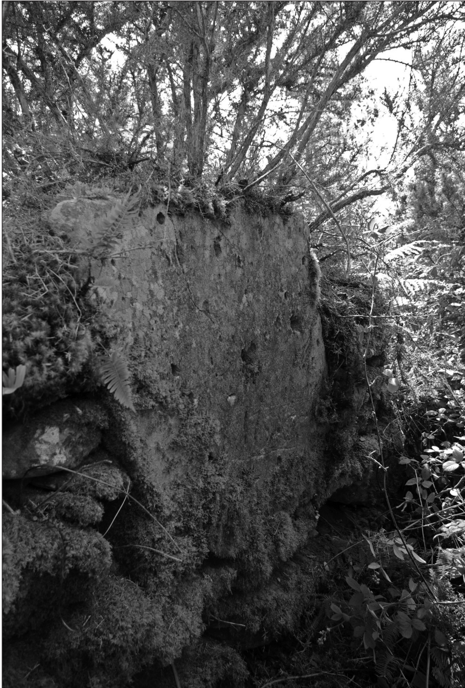
Plate 8: Date Stone at Ruined Penal chapel, Currahy ( photo author )