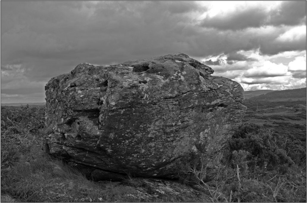
Plate 9: Currahy Mass Rock