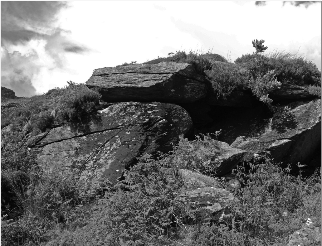
Plate 5: Priest's cave at Ballingeary, Cum an tSagairt , Mass Rock site

Depressions in stone, both naturally occurring and manmade, appear to be a feature at other Mass Rock sites in Cork including Heir Island and Kilmore in Uibh Laoghaire . The Kilmore Mass Rock lies just to the north of a possible early ecclesiastical enclosure, burial ground and souterrain in the townland of Kilmore and consists of a large slab of rock measuring approximately 3.15m by 2.3m which sits on top of another similarly sized slab. There