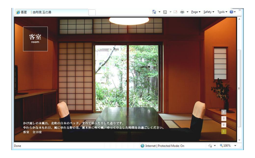
Figure 1. Guest room with the tatami floor featured on the website of Tamanoyu in Oita Prefecture

offered. In principle, Japanese-style inns offer dinner as well as breakfast (Japan Ryokan Association, 2010b). In many cases, local products unique to the region where the Japanese-style inn is located are used for the breakfast and dinner. Such delicious and sumptuous meals are also one of the main attraction factors to guests and they also expect Japanese-style inns. In fact, most Japanese-style inns feature their meals on their websites (See Fig. 2).