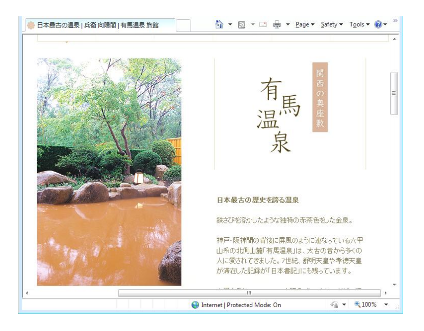
Figure 3. Hot-spring facilities featured on the website of Hyoe Koyokaku in Hyogo Prefecture (Source: Hyoe Koyokaku, n.d.)