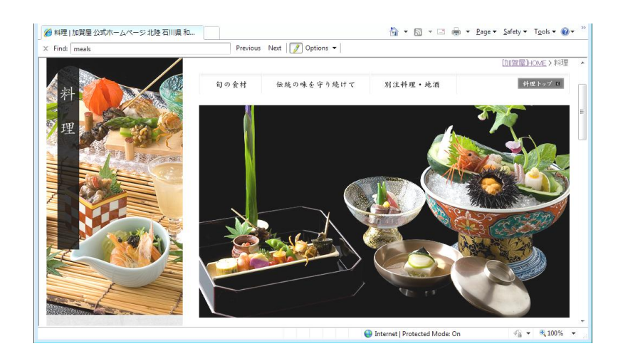
Figure 2. Meals featured on the website of Kagayain Ishikawa Prefecture