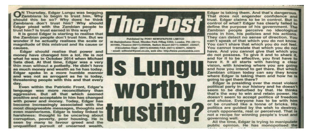
Figure 6; The Post, 10 May 2016; an example of an editorial comment by the newspaper on Edgar Lungu

At the time this editorial was published, the nation was preparing for elections to be held in three months. The governance record of Lungu at the time had become apparent, and the newspaper decided to highlight the issues of importance within context. Referencing Lungu to be "begging Zambians to begin to trust him" was deployed lexically to show that he had nothing to offer the voters that should earn their trust. Therefore, he had to resort to begging as a desperate measure. The next set of questions in the opening paragraph serves a rhetorical purpose to draw the critical takeaway message that the newspaper hoped its readers would pay attention to. Further, the editorial's title, in the form of a rhetorical question, not a genuine one, was used to sow doubt in the readership's estimation of Lungu's credentials. The rest of the editorial, as shown in the illustration Figure 7 below, serves this purpose significantly, which also consistently points to the role and influence of ownership over the newspaper's editorial policy.