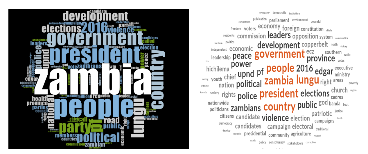
Figure 2. Word frequencies from newspaper files generated with NVivo software.

The first step was to select and import the data in NVivo from a local folder, as Kaefer, Roper and Sinha (2015, p.9) suggest. The snapshot below in Figure 2 in Appendix i illustrates this first step and how the data was, once imported into NVivo. The second step was to run word frequency queries to discover the most occurring words from the stories by each newspaper category. After this, I grouped words that had similar meanings or referred to concepts in common. Below are word cloud representations of what the frequency query produced. Of significance is the frequency of words, as shown in Figure 3 . Zambia, Lungu, violence, police, PF and UPND, and peace show how much media attention these subjects received. This also points to the media polarisation as Figure 4 (word cloud) shows the contrasts in frequency between Lungu, the incumbent during the research period, and Hichilema, the opposition party leader at the time.