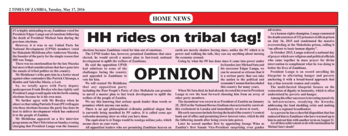
Figure 7. Times of Zambia, 17 May 2016; an example of editorial comment by the newspaper on Hakainde Hichilema

The cut-out in Figure 8 below carries the entire editorial for illustration purposes.