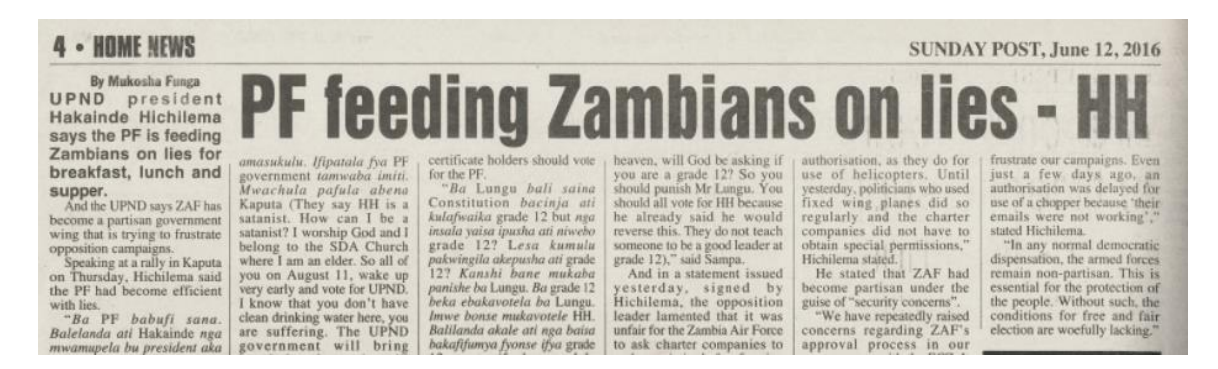
Figure 5; The Post, 12 June 2016; a story headline describing the ruling Patriotic Front party.

Figure 5 below illustrates the polarisation that characterised the newspaper's coverage and treatment of subjects.