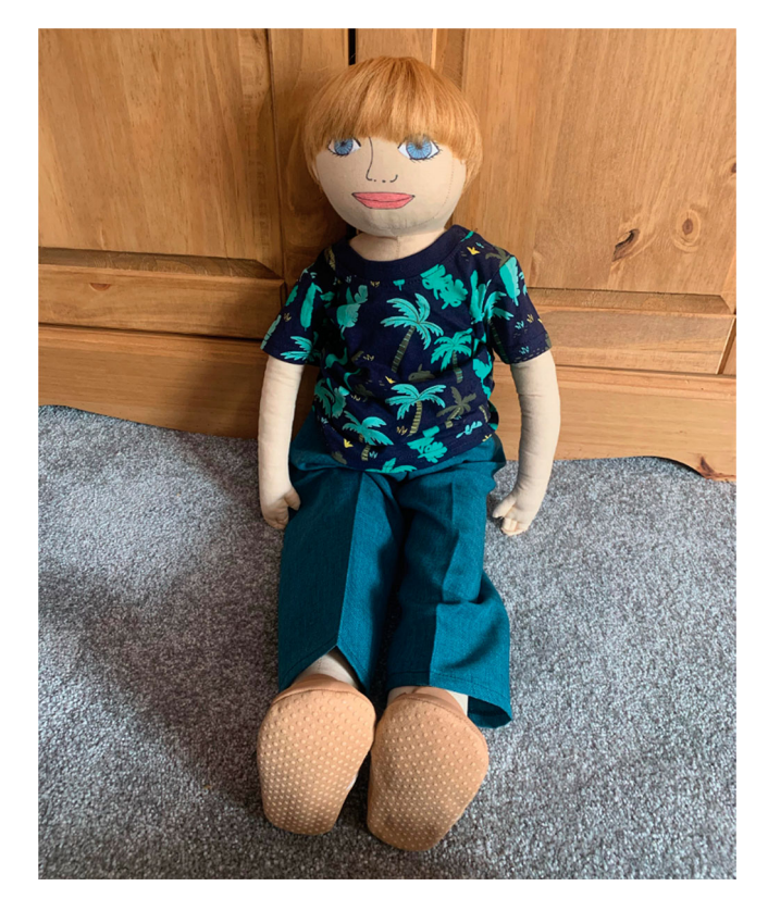
Figure 1. Maciej, a European Persona Doll.

Persona Doll named Maciej who is currently in UK foster care. We conclude this Viewpoint by arguing the case for Persona Dolls as a participatory research tool for use with young children to combat the insider/outsider researcher status dilemma, facilitating a position of inbetweenness.