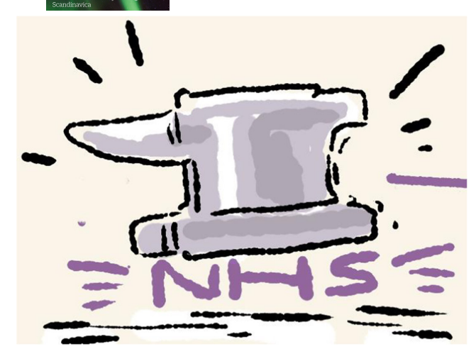
FIGURE 2 Illustration representing themes designed by a "live scriber" who drew this during a presentation of our data

In the lead-up there were lots of unknowns, lots of uncertainties. It was business as usual until we realized the scale of it, then it was a quick 10 days where we were like, we really need to prepare for the worst. What are we going to do?