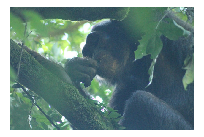
Fig. 2 MON consuming her infant

corpse from LKU and chased him away, before moving out of the party to begin consuming the corpse while sitting on the ground. After 2 min, BEN was joined by MON and LAN, who observed him feeding. BEN moved into a tree to continue consuming the corpse, supplementing the meat with leaves [Fig. 1; video in Electronic Supplementary Material (Supplementary Material 1)]. MON joined BEN in the tree and groomed him while he ate. MON stopped grooming to begin begging (placing her upturned hand near the mouth of BEN). LAN moved into the tree and began grooming MON. Approximately 30 min after the start of the event, MON begged for and took a piece of the corpse from the hand of BEN and began to feed [Fig. 2; video in Electronic Supplementary Material (Supplementary Material 2)]. LAN stopped grooming MON to beg from BEN (placed his hand near the mouth of BEN) but did not acquire a piece of the corpse. After his failure in begging, LAN pant grunted to BEN and began to groom MON. MON and LAN mutually groomed briefly, before MON returned to grooming and begging from BEN. MON acquired three more pieces of the corpse, which she ate. BEN left the tree with the remainder