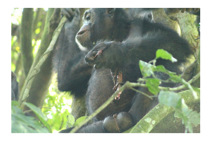
Fig. 1 BEN holding and consuming the corpse of MON's infant