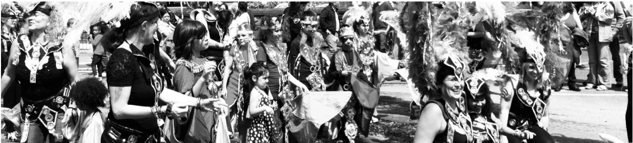
Figure 7. Brouhaha Carnival procession through the city streets to Princess Park and food

week period and is the largest contemporary international art event in the UK. In a way though the city was already event-mental as a series of alternative events. These events grew and started to link and consequently multiply as they fed off each other and developed. The city has invariably been a centre of popular culture it has two cathedrals, two premier league football teams, two major art galleries and music has 'of course' always been central in this popular culture mix. The city's ethnic mix also meant that there was always some cultural celebration such as the Brouhaha Carnival, Chinese New Year, Africa Oye, Halloween Lantern Show, Mathew Street festival, The Grand National. In a sense all of this initiated what has been termed the 'festivalisation' of the city in the new millennium which has been a major factor in the boosting of civic pride and the attraction of 'creativity' back to the city.