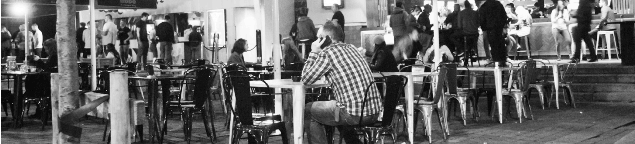
Figure 6. Concert Square the development of a space created place of evening entertainment.

this period. The project completed in 1995 made 'urban space'. Splash made a square, with a series of bars, basement clubs and urban living units along one side of the square. This urban space rapidly became the centre of the bar clubbing culture and the surrounding area known as Rope Walks was increasingly becoming a popular cultural hub. Concert Square is historically seen as the initiation of the revitalisation of this area at that time Liverpool's creative quarter and Urban Splash are now considered one of the UK's most innovative developers.