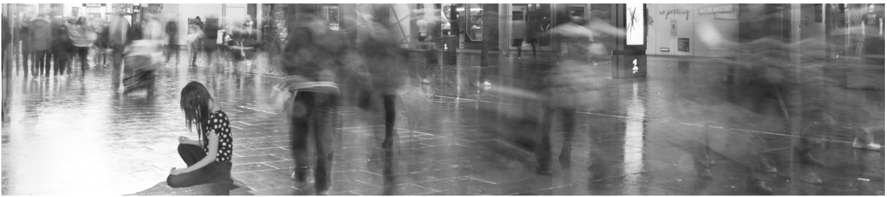
Figure 3. Liminal state, the unclean regarded as polluting to those never inoculated against them

exchange of goods and culture across this edge and yet the city's inhabitants seemingly continued to look to its edge for salvation?