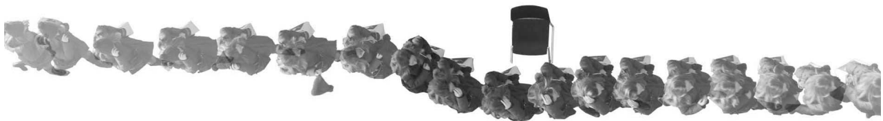
Figure 4. we hold the world at bay with these patterns of behaviour termed “schemata