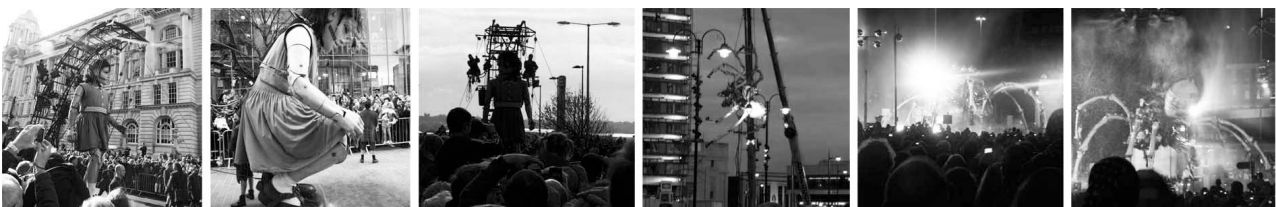
Figure 1. Reconstructing the city through unique and cyclical events

The edge is where happenings intensify, it is the co-location of phenomena in place that catalyses events. "All human action takes and makes place. The past is the set of places made by human action. History is a map of these places"[08] Topographic locations with dynamic edge-mental conditions tend to develop into serial places as city. The friction generated by the density of a city's edge conditions generating overlap to gathered processes enabling an intensity of events. City is event-mental reflecting an underlying structured edge condition system associated with our activities and expectancies as preferences of perception. These perceptual preferences appear to be in a "aufhebung" [26] state.