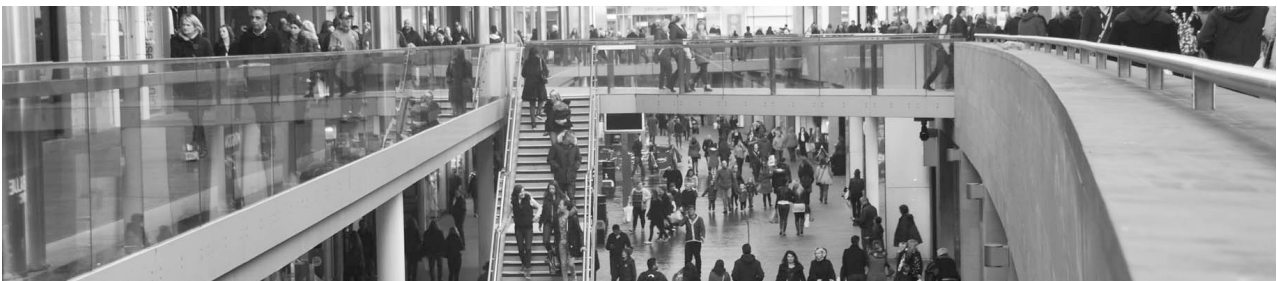
Figure 8. Five zone's were aimed at to promote this diversity; Valley

Liverpool One may have ridden in on the coat-tails of the city of culture it is however the largest legacy of this 'event'. There was some concern over the viability of forty-two acres of retail in the centre of Liverpool one of the poorest cities in the country. A concern heightened as the world economies crashed, a year prior to the city of culture and the, much publicised opening, of the largest retail development in Europe. As 'Kunzman' stated "Each story of regeneration begins with poetry and ends with real estate" [24] Liverpool One was opened in phases on 29 May 2008 and 1 October 2008, during Liverpool's year as European Capital of Culture, to a 100,00 footfall in each of the first days. The visual variation of the scheme works well it constitutes a picturesque experience of unfolding architectural features and views but what is especially gratifying is its integration with surrounding areas of the city, so much so that it is difficult to know whether you are inside or outside Liverpool One. This visual variety as complexity is overlaid with distinctive management policies of constant care. Then it is integral with the rest of the city's labyrinthine streets and open twenty-four hours with over a hundred staff maintaining the site, on a continual cleaning and repairing schedule. Events within the matrix are managed on a cyclical basis with the renewed 'Chavasse Park' hosting skating in the winter and a beach in the summer as well as a series