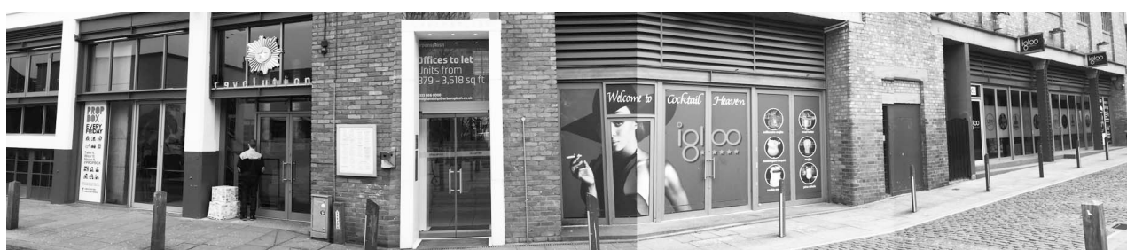
Figure 9. The Tea Factory refurbished by Urban Splash in RopeWalks, the first creative quarter