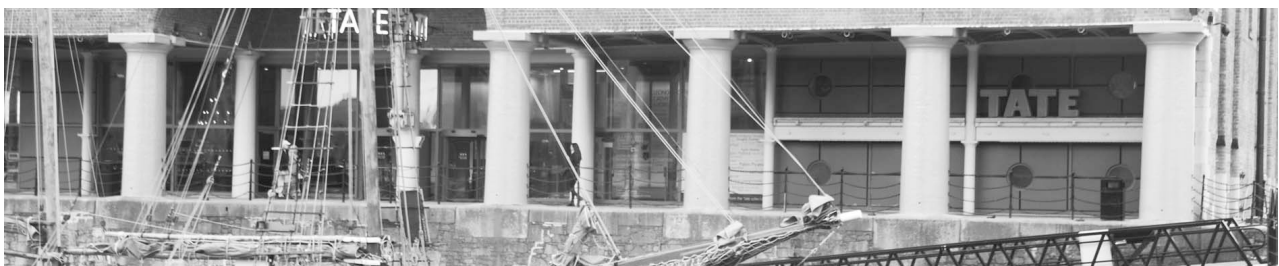
Figure 5. The Tate of the North first of a constellation of Tate galleries across the UK

Despite all this effort the scale of the problem meant that the regeneration efforts existed as disjointed islands of re-development around the city centre and along the dock edge there was little cohesion between schemes. Urban living did however quadruple over this decade, up to two thousand mainly through loft living conversions on the docks. Retail rent within the city almost doubled within the same period, signs of a marginal revitalisation of the inner city. Historic buildings played a key role in the strategic choices perhaps in their abundance and with little choice but refurbishment as an economic or policy option they were turned into an asset. Dockland warehouses were refurbished as light industrial office and housing there was little new architecture