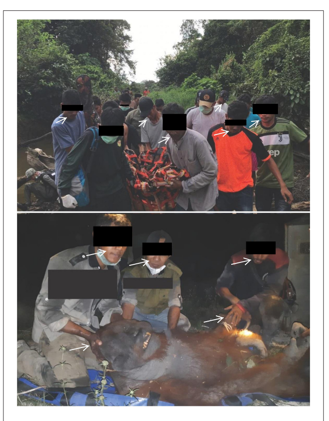
FIGURE 3 | PPE use and human proximity in wild-to-wild orangutan translocations prior to COVID-19 pandemic. Pictures showing examples of mixed use of PPE and human proximity to orangutans during capture and releases of wild orangutans prior to March 15, 2020. The orangutan in the top photo is in the orange and black net. Identifiable human features and organizational logos are obscured to protect anonymity.

( Table 2 ). We included data presented in this study, along with contextual information on conservation, socioeconomic, political, and ethical considerations from published literature (see discussion) to answer the problem description questions posed by OIE and IUCN (36). This problem description highlights a large number of data gaps and assumptions, indicating that a qualitative method of assessment based on the precautionary principle will likely be needed in the first iteration of a DRA for orangutan translocation.