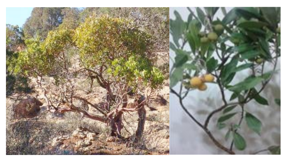
Figure 2. Arbutus pavarii shrub