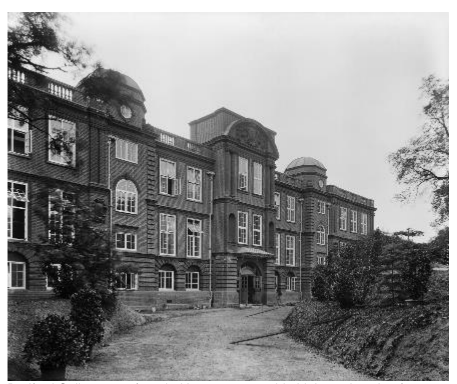
Bedford College was founded in 1849 to provide higher education for women. It moved to these new premises in Regent's Park, London, in 1913.

Although promoted as a way of providing education for all, Mechanics' Institutes focused primarily on educating men and deep into the late 19th century, the education of women was still rare. With full emancipation of women not achieved until 1928, it was left to organisations such as Bedford College and Somerville College to promote women's education.