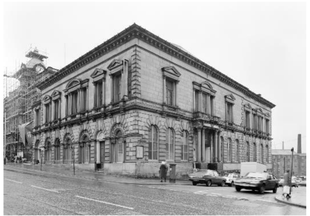
The Mechanics' Institute in Burnley, Lancashire, was built in 1854-5. It's palazzo-style design echoes the palaces built by wealthy families in 15th-century Italy.

Whilst Sunday Schools focused primarily on educating the young, the foundation of Mechanics' Institutes during the industrial revolution moved education for all to adults, and specifically working-class adults.