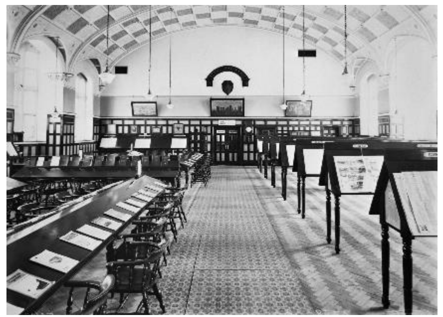
The well-lit Reading Room in the Mechanics' Institute in the centre of Swindon's Railway Village. Built in 1853-5, it was funded by the town's Great Western Railway workers.