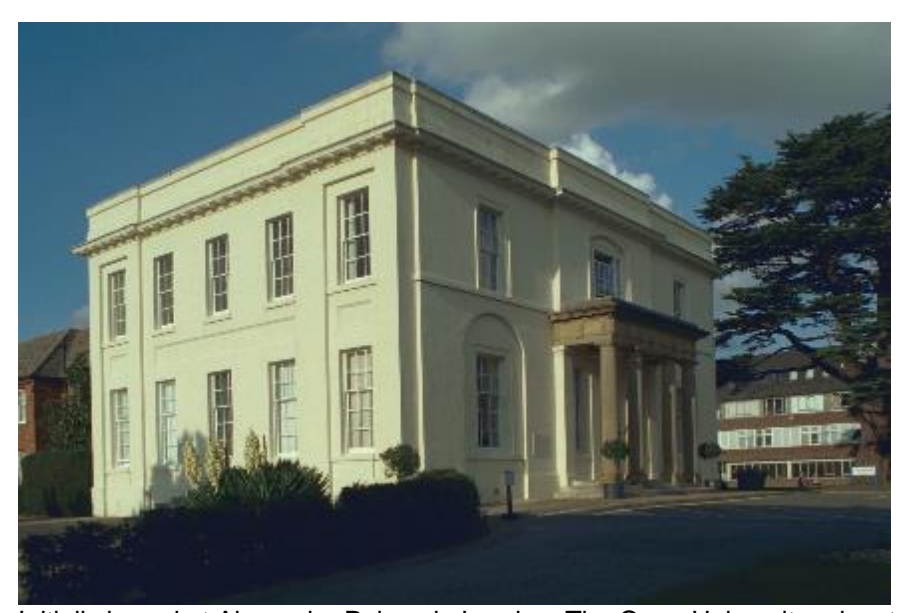
Initially based at Alexandra Palace in London, The Open University relocated to a campus at Walton Hall in Buckinghamshire. Its ambition was to provide the power of learning to anyone, anywhere

Whilst the idea of equipping the working class with the ability to lead proved hugely controversial, the establishment of The Open University in 1969 was a far more sedate affair. The purpose of the new university was to widen access and by a series of innovative approaches, such as the extensive use of radio and television as part of the pedagogy, it opened the door to university to many who had been excluded beforehand.