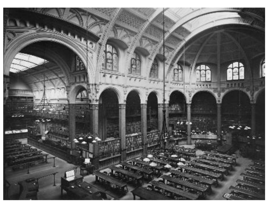
The Reading Room and Reference Library at the Central Lending Library, Birmingham. This grand building was demolished in 1974 to make way for the city's next generation of library, which was itself replaced in 2013.