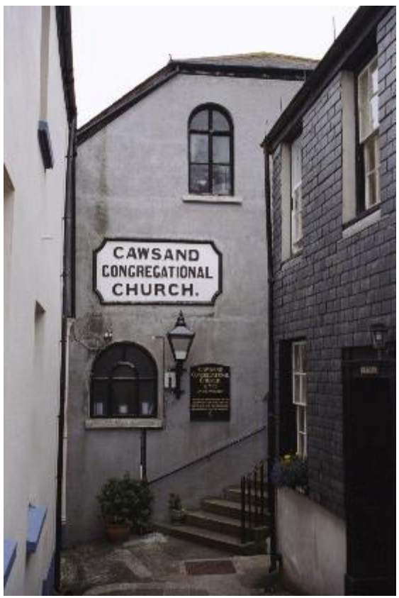
The Sunday School at Cawsand Congregational Church in Cornwall was located beneath the church's auditorium.

Our journey starts with the earliest attempts to move education from the elite to the working class, which were provided by non-conformist organisations in the form of Sunday Schools.