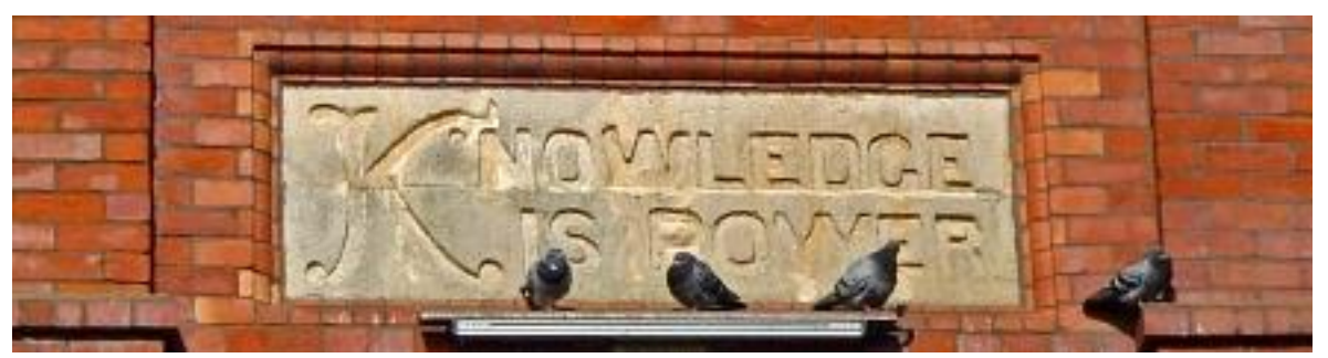
The inscription in the pediment on the former Pillgwenlly Library, Newport, South Wales.