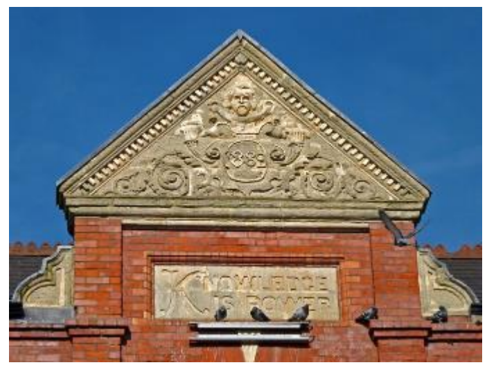
The inscription beneath the pediment on the former Pillgwenlly Library, Newport, South Wales, inspired the opening line 'Libraries gave us power', in the Manic Street Preachers' 1996 hit 'A Design for Life'.

By the start of the 20th century, the movement towards education for all had gathered pace with libraries becoming a central feature of many towns. Often these buildings were visually arresting and designed to inspire those who entered them.