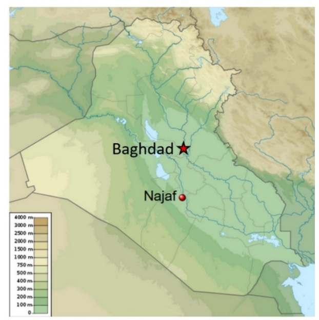
FIGURE 1. Location of Najaf. Elevation map (Urutseg, 2011)