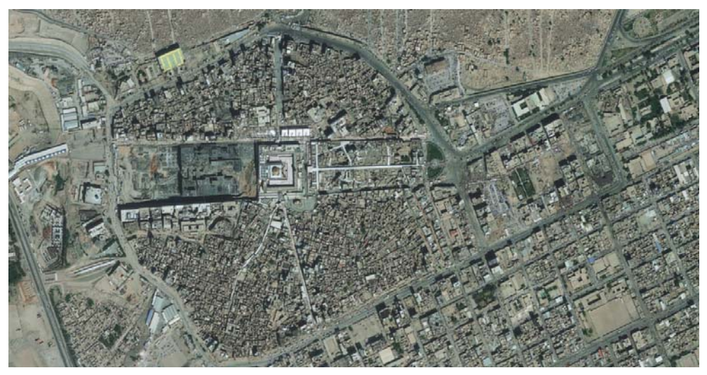
FIGURE 2. Arial view of Al-Najaf Old City (Nasar, 2015)

it is imperative to preserve the heritage assets of the city and the integrity and vitality of the sacred centre (Directorate of Urban Planning of Najaf Governorate, 2006).