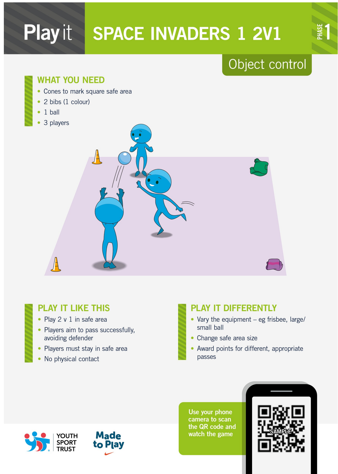
Fig 1. Example of a MOGBA activity (Space Invaders 4, Phase 3, Object Control) front of card 'Play it'.

https://doi.org/10.1371/journal.pone.0253747.g001