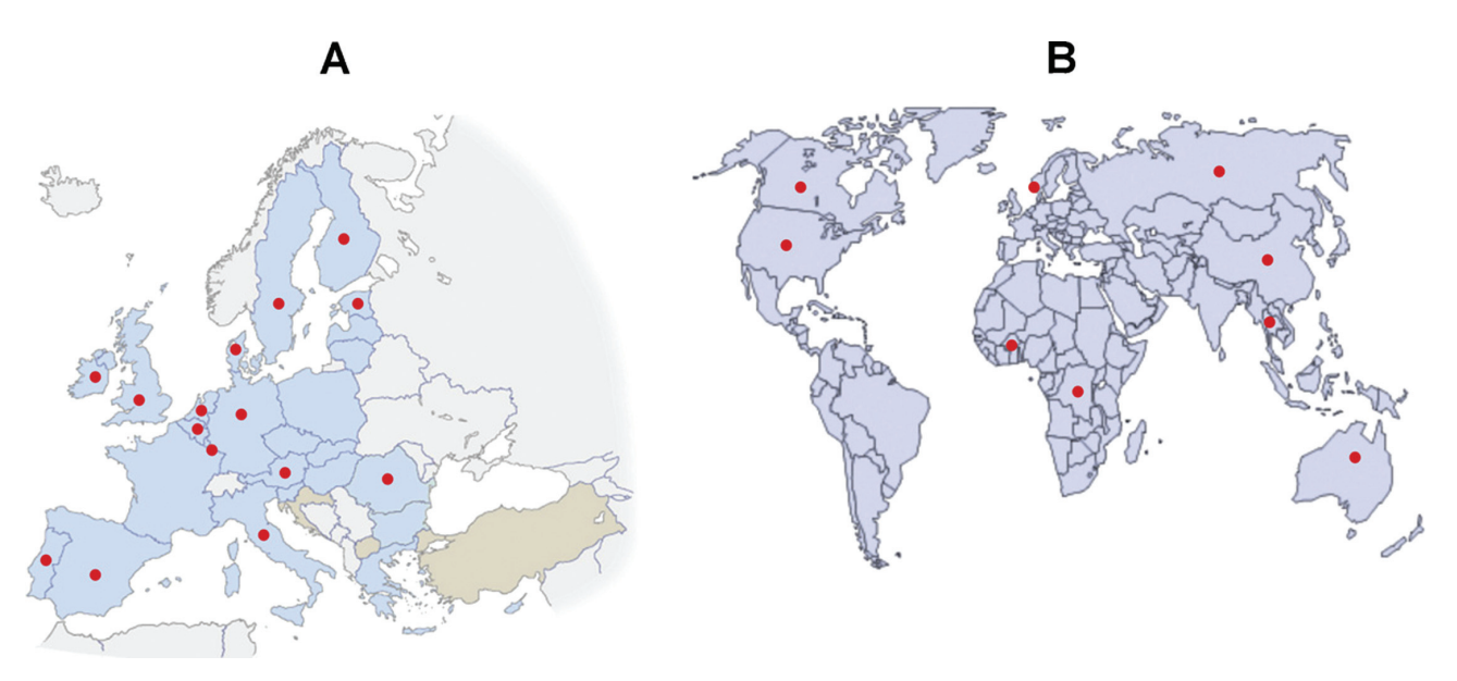
Figure 1. Distribution of GP-TCM members within and beyond the EU. (A) Fifteen EU member states were involved in GP-TCM. They were Austria, Belgium, Denmark, Estonia, Finland, Germany, Ireland, Italy, Luxembourg, the Netherlands, Portugal, Romania, Spain, Sweden and the UK, as highlighted by red dots. (B) Nine non-EU countries were involved in GP-TCM, including Australia, Burkina Faso, Canada, China, D.R. Congo, Norway, Russia, Thailand and the USA, also highlighted by red dots. [Ref: 38].

good for the quality control of such medicines, but also useful for the discovery of new indications or the development of new formulations. In addition to GMP conditions applied during production, good quality control analyses should include both chemical fingerprints and biological fingerprints of botanicals.