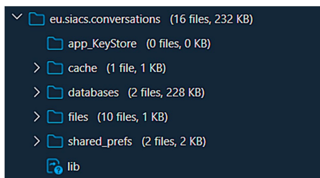
Fig. 1 Main folder structure of the Conversations app

In the following sections, we present the forensic analysis of the Conversations and Xabber apps respectively.