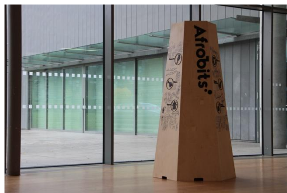
Figure 1. Afrobits Installation

Afrobits is an interactive installation that enables audiences to explore a new narrative of the Trans-Atlantic Slave Trade. It presents the tangible and intangible contribution through sound, music, instruments and stories of people enslaved during the Trans-Atlantic Slave Trade. The installation is a wooden cone structure with attached conductive sensors that are connected to a micro-controller, linked to a sound system. The conductive sensors detect the proximity of the user and triggers a specific sound file through the micro-controller. Afrobits includes 9 points of interaction: Liverpool, Africa, the Middle Passage, Barbados, Cuba, Brazil, Jamaica, and the North and South of the United States of America. Each point of interaction contains a small piece of original research reflecting on the place, its music and African influence, as well as a representative soundtrack, iconography and illustrations of local life (see Figure 1). Afrobits thus allows users to engage with Intangible Cultural Heritage through physical interaction with a tangible interface.