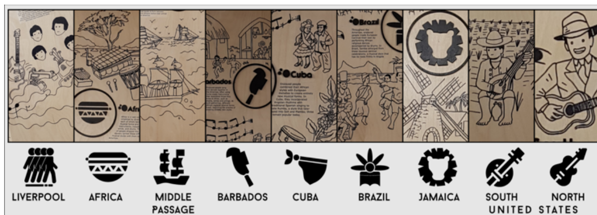
Figure 3. Afrobits Interaction Points

Congress (USA), as well as some recent sound samples from artists such as Bob Marley and the Beatles. Figure 3 shows all these interactive points and some of their visual elements, which were also rendered from historic archives.