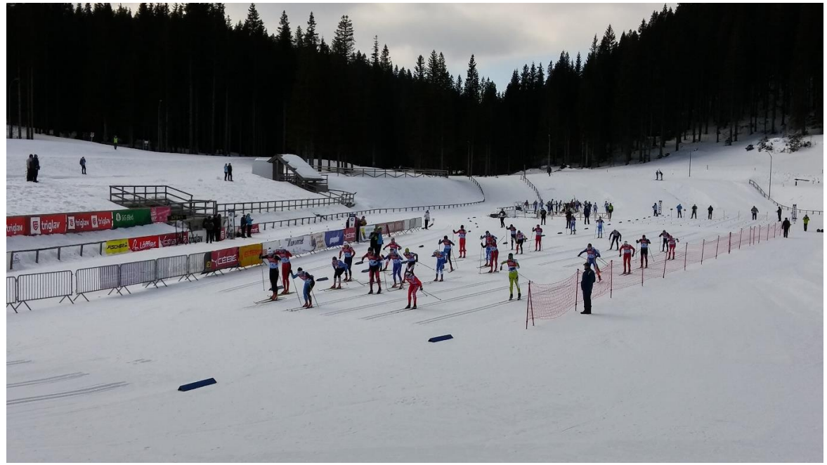
Figure 1. Starting line at the No Border Cup

To expand operations due to the success and exposure, the local project planning facility in Pokljuka are working for the International Biathlon Union (IBU), who are proposing new infrastructures and hotels to accommodate increased capacity, but because this is a National Park with strict environmental regulations the area is closed to expansive developments. Other limitations expansion (under the control of the European commission) are regulations on building