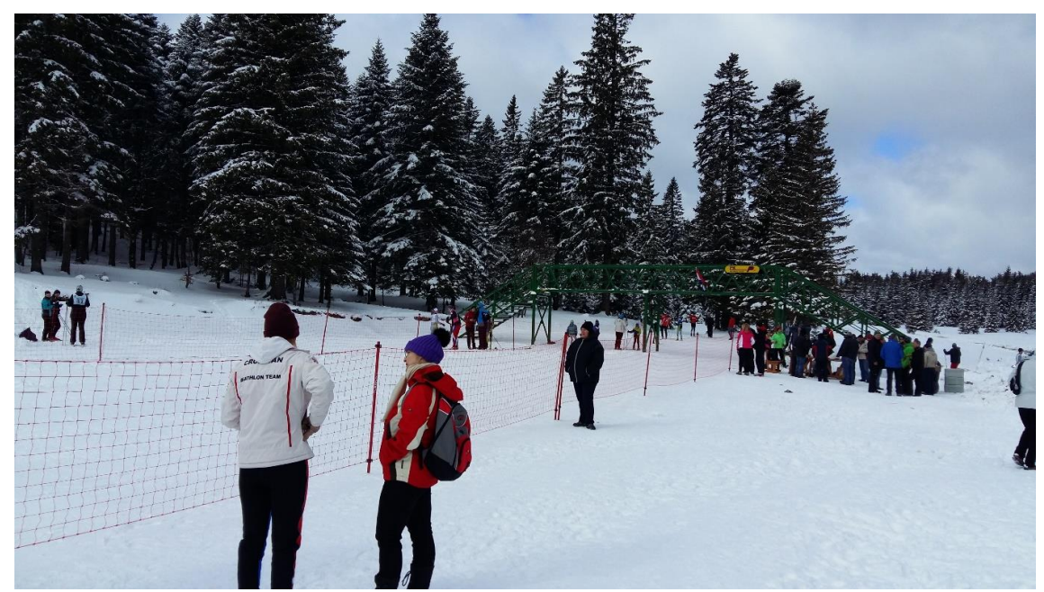
Figure 3: Finish line of the Mrkopalj Peace Memorial (cross-country race), Gorski kotar