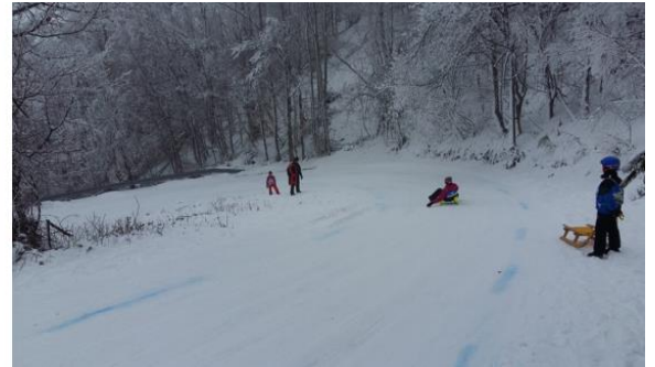
Figure 4. Sledding in Lokve, Gorski kotar

the impact of the sledding centre and areas where events and activities will take place.