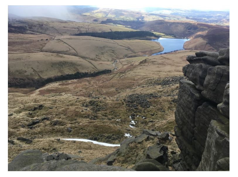
Figure 1. Evidence of technology in the natural landscape (McLain, 2018)

Curriculum can be viewed and understood through different theoretical lenses, each with their own drivers, such as aims (Reiss & White, 2013), knowledge (Young, 2008) and experience (Biesta, 2014). In these politically turbulent times for D&T in England, we adopt a pragmatic stance (Biesta, 2014; Biesta & Burbules, 2003; Dewey, 1966, 1944, 1916) side stepping the whole knowledge verses skills debate and focusing on experience and the interaction between mind and hand (Kimbell et al., 1996). We do not argue for a new curricular hegemony, dethroning knowledge and reinstating skill, but a more nuanced and accommodating political climate with regard to curriculum and pedagogy – both the 'Big P' of national and the 'small p' of local policy and practice.