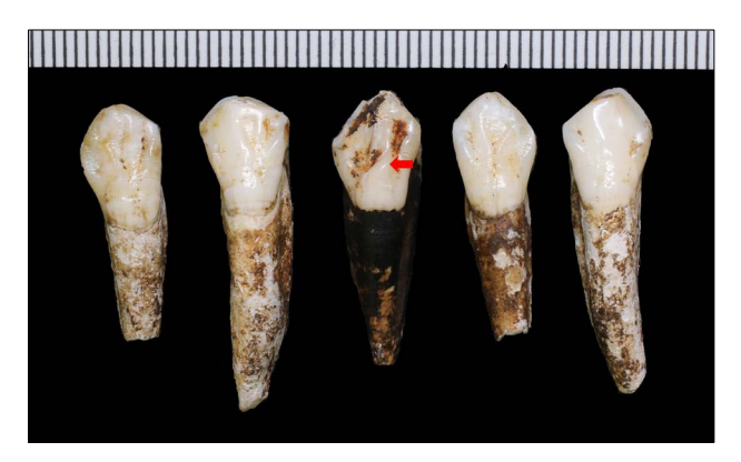
Figure 1: Lingual view of StW 585 from L/63 area of Lincoln Cave (centre) and Homo naledi maxillary permanent canines from the Dinaledi Chamber. Left to right: U.W. 101-337 RC, U.W. 101-908 RC, StW 585 RC, U.W. 101-501 LC, U.W. 101-412 LC. Arrow shows large tuberculum dentale of StW 585.

more mesiodistally curved, i.e. the mesial and distal crown edge curve inward toward the midline of the tooth, more than H. naledi specimens such as U.W. 101-337 (Figure 2). The crown of StW 585 is short and robust relative to its overall size while H. naledi canines appear tall (Figure 2, Figure 3).