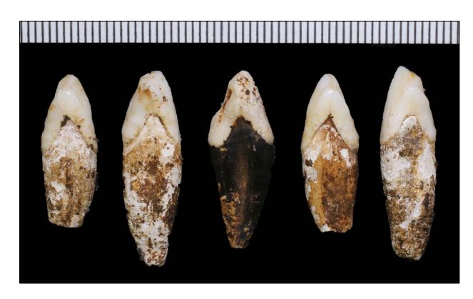
Figure 3: Mesial view of StW 585 from L/63 area of Lincoln Cave (centre) and Homo naledi maxillary permanent canines from the Dinaledi Chamber. Left to right: U.W. 101-337 RC, U.W. 101-908 RC, StW 585 RC, U.W. 101-501 LC, U.W. 101-412 LC.

The StW 585 and H. naledi canines do share several traits, including, lingually, a mesial crest that is shorter than the distal crest, and a mesial shoulder that is more apically placed than the distal shoulder (Figure 1). The labial face is minimally curved incisocervically in both StW 585 and H. naledi (Figure 3). All have a mesial crest that is more concave than the distal counterpart. Also, the mesial and distal labial grooves are weakly expressed in all canines. A deep groove runs along the mesial length of the root, with a shallow groove along the distal length. StW 585 falls within the absolute size range of variation for H. naledi (Table 1). While root length is not a conclusive feature for determining species, StW 585 overlaps in size with the H. naledi sample.