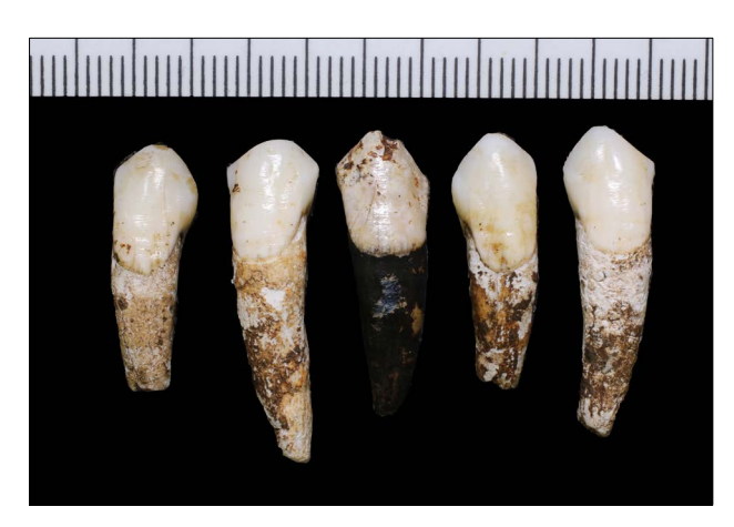
Figure 2: Labial view of StW 585 from L/63 area of Lincoln Cave (centre) and Homo naledi maxillary permanent canines from the Dinaledi Chamber. Left to right: U.W. 101-337 RC, U.W. 101-908 RC, StW 585 RC, U.W. 101-501 LC, U.W. 101-412 LC.